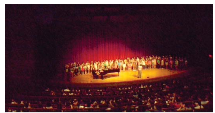
VOCAL: Celebrate with Music

Lewis said. "Everything on display had already been used in shows. Technical theater students work to create items of the highest quality that can be reused in future productions. I can also use this student work as I teach future classes."