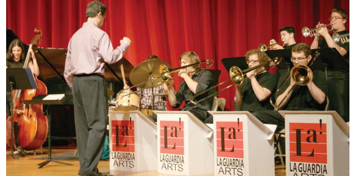
INSTRUMENTAL: Celebrate with Music