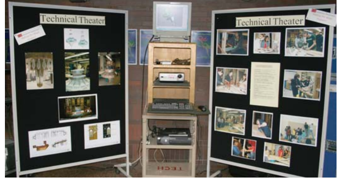
DRAMA/TECH.: So You Think You Can Act?