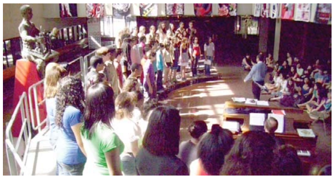
VOCAL: Celebrate wtih Music

LAGUARDIA'S SPRING 25TH ANNIVERSARY EXTRAVAGANZA