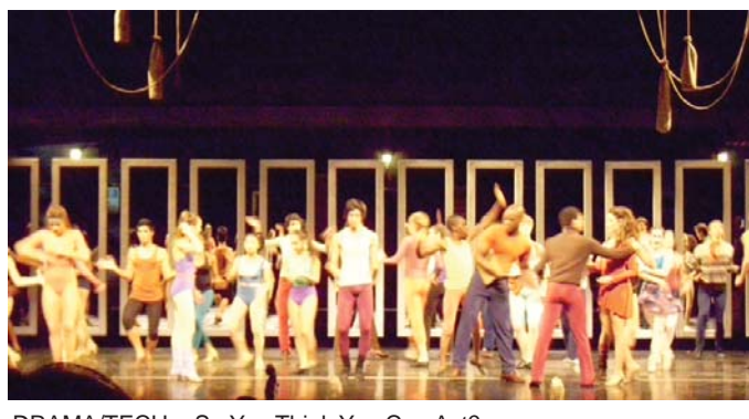
DRAMA/TECH.: So You Think You Can Act?

on to say that students who were working on landscapes in art classes could bring their passion for painting into social studies courses. They could examine and discuss landscape painting and the development of abstract expressionism as a response to the nationalism of the mid-1800s.