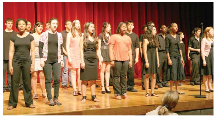
VOCAL: Celebrate with Music