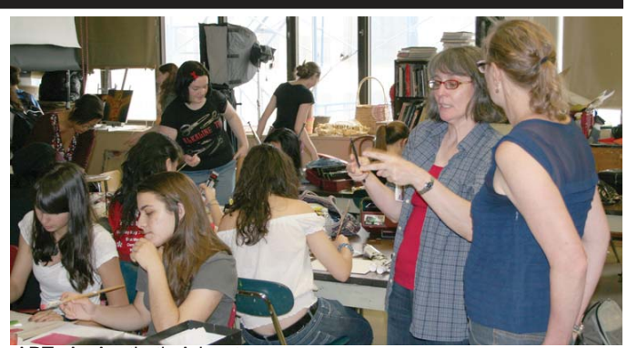
ART: An Aesthetic Adventu

students progress from Orchestra 5 to Orchestra 8 and from Studio Practice 2 to Advanced Painting has been impressive and quite entertaining. Although I could not attend every program prepared by our dedicated studio teachers, I have greatly enjoyed witnessing the advancements our students make every day in their studio classes. I am looking forward to organizing next year's festival, which will be a celebration of LaGuardia's dual-mission history and legacy."