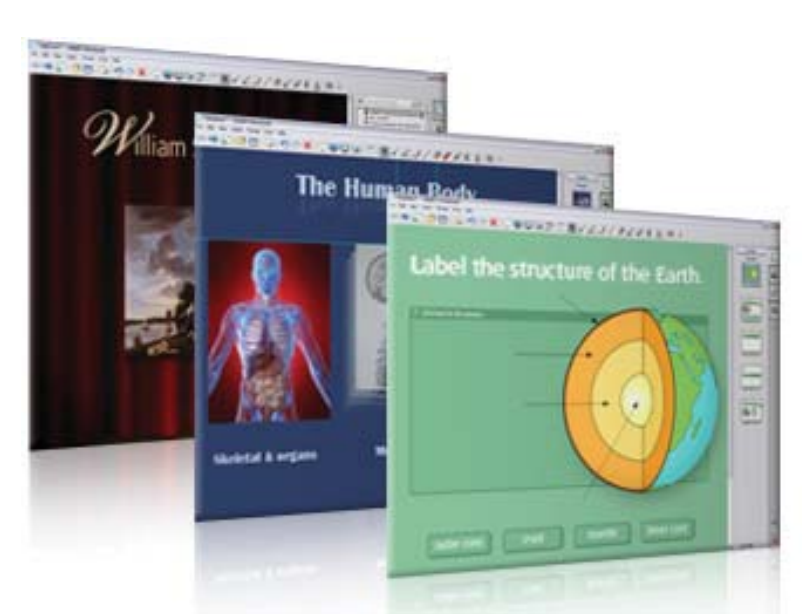
"SMART Board Interactive Whiteboard System." <u>Smart Interactive Solutions for Education, Business, and Government.</u> 2012. 17 Jan. 2012. <a href="http://smarttech.com">http://smarttech.com</a>.