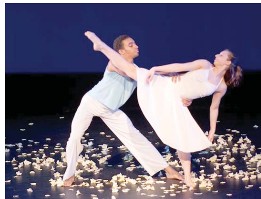
LaGuardia's dancers impressed audiences.