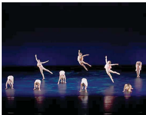
Dancers clearly enjoyed themselves.

LaGuardia dancers performed for rapt audiences during the school's Spring 25th Anniversary Festival.