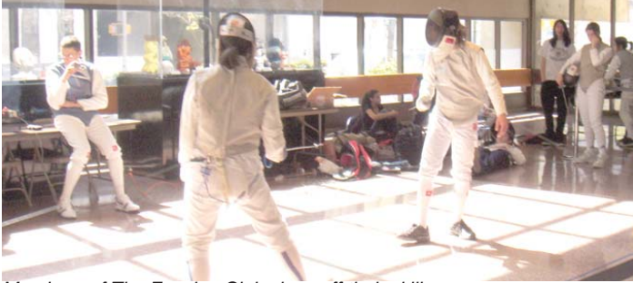
Members of The Fencing Club show off their skills.