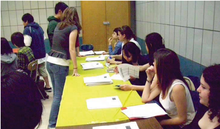
AP students told visitors about their experiences.