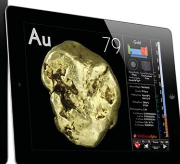
"iPad makes the perfect learning companion." Apple.com. Apple, 2011. Web. 15 Mar. 2011.