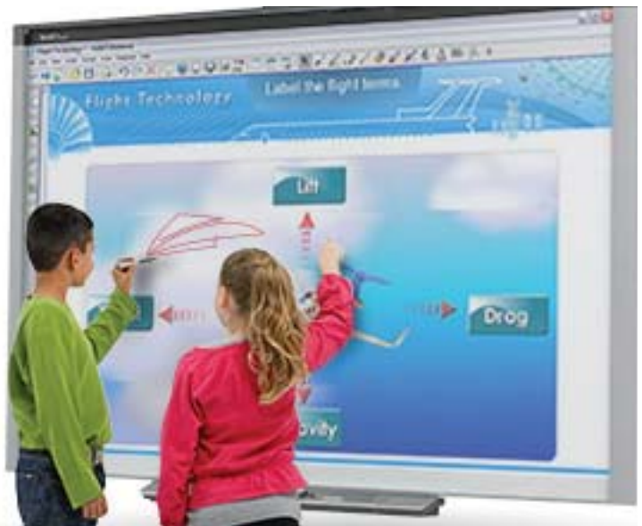
"SMART Board Interactive Whiteboard System." Smart Interactive Solutions for Education, Business, and Government . 2012. 11 Jan. 2012. < http://smarttech.com >.